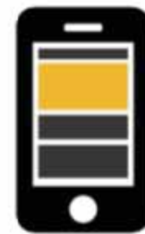
Top Double Banner