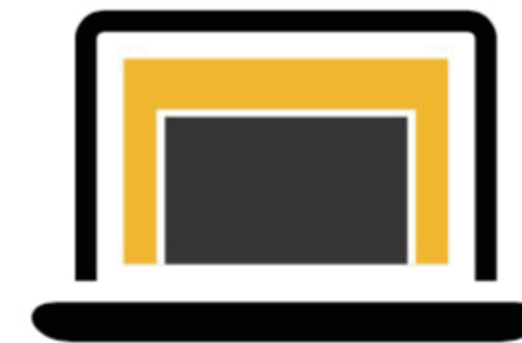
Skin + Billboard