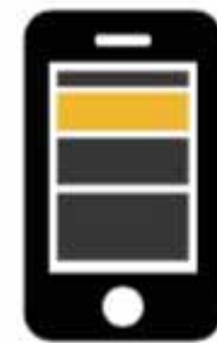
Top Single Banner